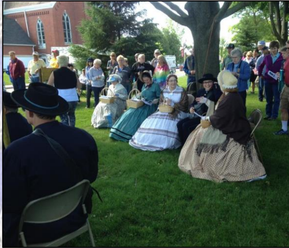
Civil War Ladies