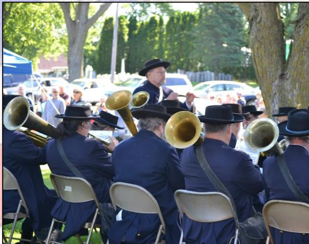
1 st Brigade Band